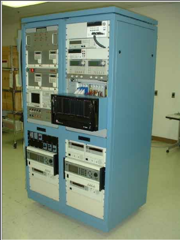
UMATE IIA Test System